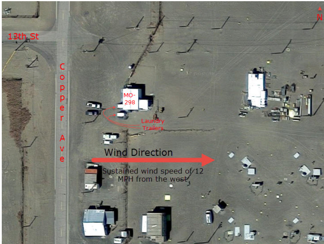
Aerial view of MO-298 in West Area

At 0929 on March 30, 2017 the Central Shift Office (CSO) received notification that three Health Physics Technicians (HPT's) reported smelling strong odors in the SX-Farm Change Trailer, MO-298. The CSO initiated an AOP-15 event and sent notifications via the Shift Office Event Notification system (SOEN).