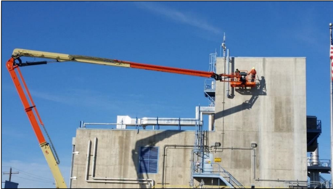
Facility Scan on 242-A Stack, 11/01/2016