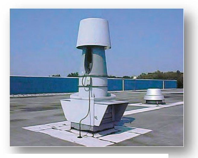
Strobic Air Dilution Exhaust System

3<sup>rd</sup> Quarter Summary: An investigation into abatement technologies began in earnest in the first quarter of FY17 and included Strobic Air Dilution Fan technology. At the end of Q2, the statement of work (SOW) for the Strobic Air contract was approved and in late May the subcontractor staff was on-site for tours and meetings with WRPS team members. Strobic Air staff provided an overview of their technology and reviewed functional requirements with project personnel. Strobic Air is developing the fan design, with preliminary reviews on-going, for the 241-AW Tank Farm primary exhaust system. Completion of the design is scheduled for next quarter.