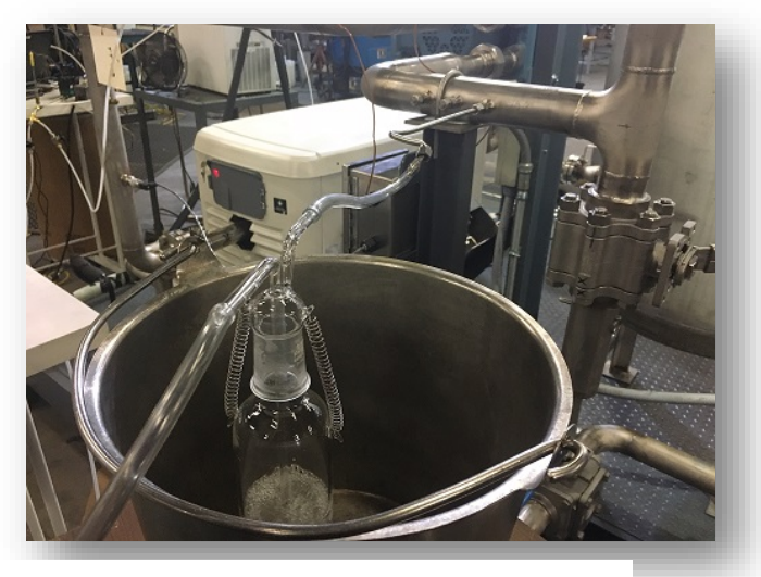
NUCON Lab System that Generates Vapors

testing and acquired the instrumentation needed to complete the Proof of Concept test in early May. The tests successfully demonstrated the destruction or removal of greater than 95% of the chemical vapors fed to the system. Preliminary analyses indicates that the destruction/removal efficiencies were quite good, ranging from 82% for furans to \geq 96% for formaldehyde, pyridine/toluene, ammonia, and mercury. Uncertainties in the results are yet to be evaluated and limitations in the test apparatus at NUCON has led to a recommendation that the proof-of-principle tests be repeated in FY17 in Richland where a more thorough and controlled test can be performed to ultimately advise a decision to move on to a full-scale technology demonstration. An integrated project team is being established to prepare for delivery of the system and manage additional prototype testing needed to resolve these limitations. In addition, work was initiated on a Technical Readiness Assessment and Technology Maturation Plan for the NUCON system.