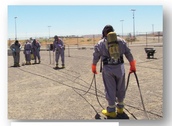
Portable-air-line-breathing training at HAMMER

The Solutions issue 397, published June 26, 2017, reported, "A group of WRPS and subcontractor tank farm workers underwent two days of training and mock-up exercises in the use of portable air-line breathing systems last week at HAMMER." Furthermore, "An in-farm trial is planned for later this summer, and a decision is pending on additional training to potentially expand WRPS s air-line use to additional jobs personnel."