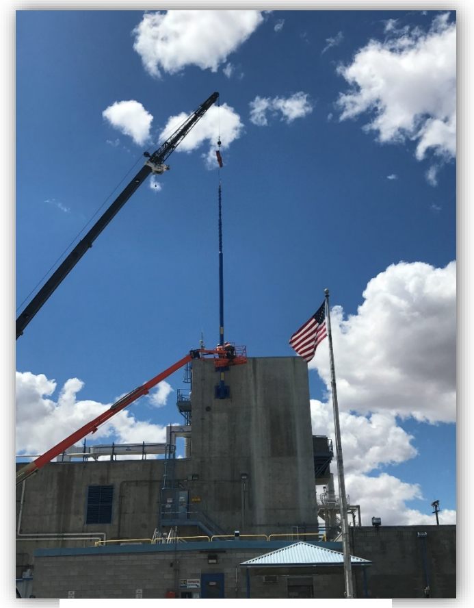
242-A Stack Installation – June 2017

vessel vent exhaust stack installation was completed in time to support startup of evaporator campaign EC-06 on July 1st.